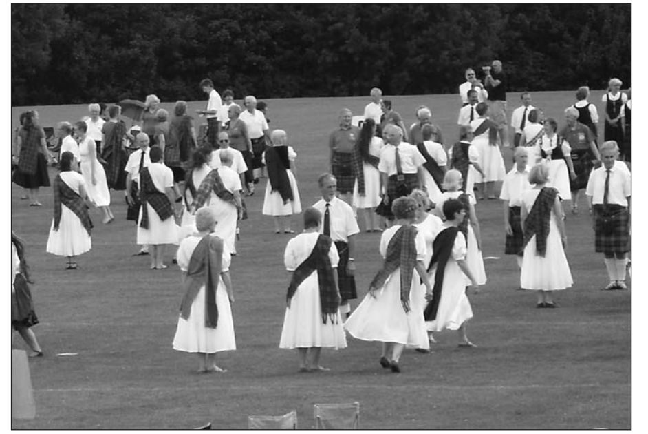
White Rose Festival July 2010