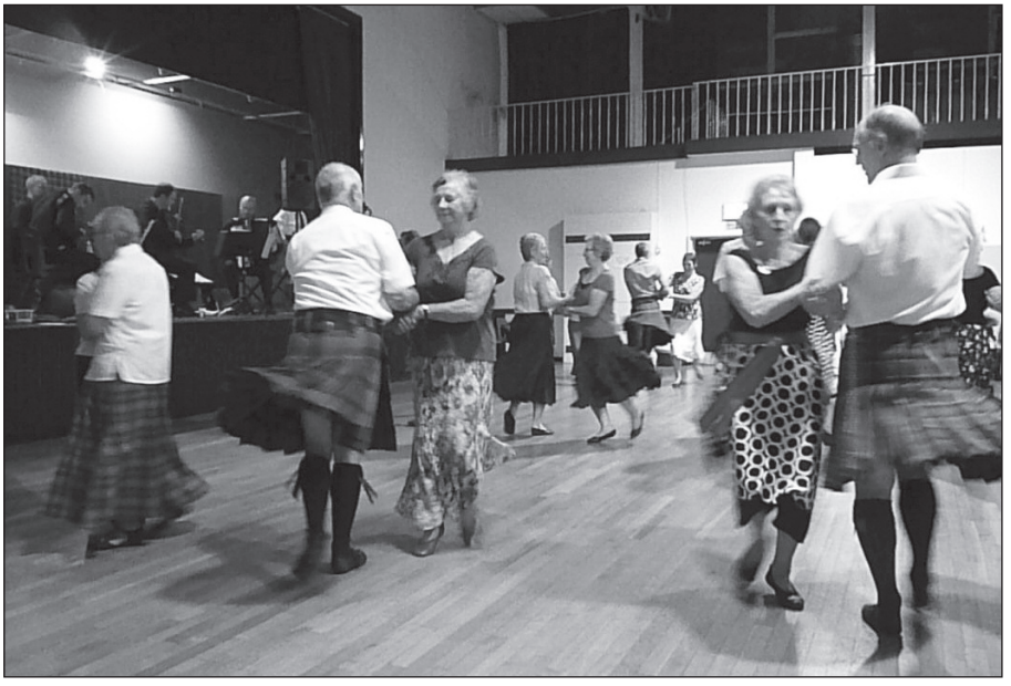
Dancers at the September Branch Dance