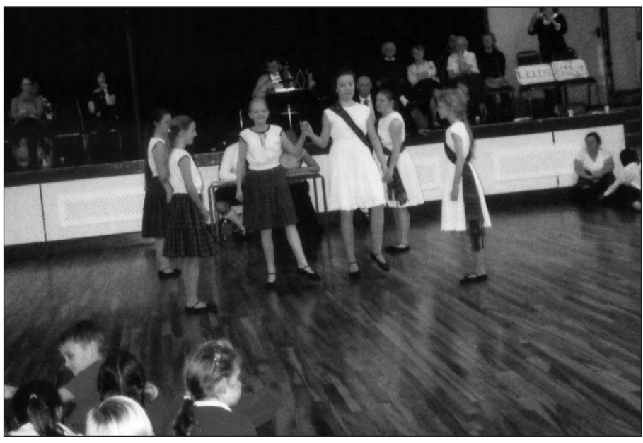
The Children's Team at Darlington Festival