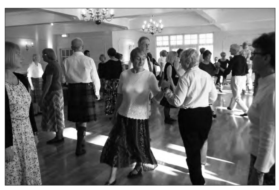
Malhamdale Weekend Course - December 2014