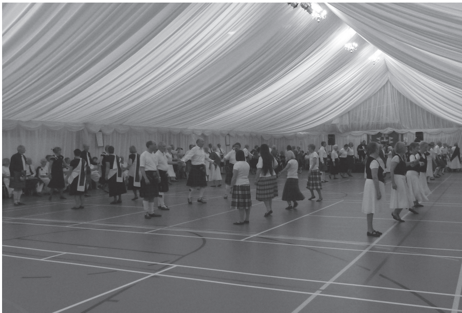
White Rose Festival 2016 see pages 2 & 3.