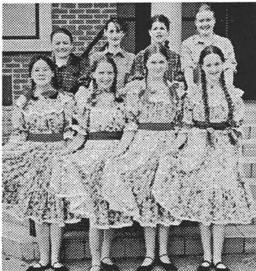
Above: The teenagers a la Scottish and American!!