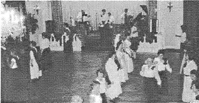
The Cape Town Ball

On the Friday we were off on our 'Trip to the Drakensberg' for the Johannesburg weekend school. It was held in a hotel nestling right in the Drakensberg Mountains.