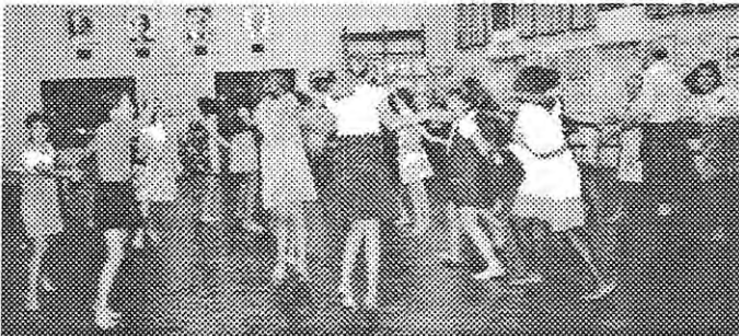
Children dancing (barefoot) in Harare

We had had blue skies throughout our visit and this continued in Harare. It was warmer in Zimbabwe. I went into a school in the afternoon to teach three sets of children. They were just like ours but they dance