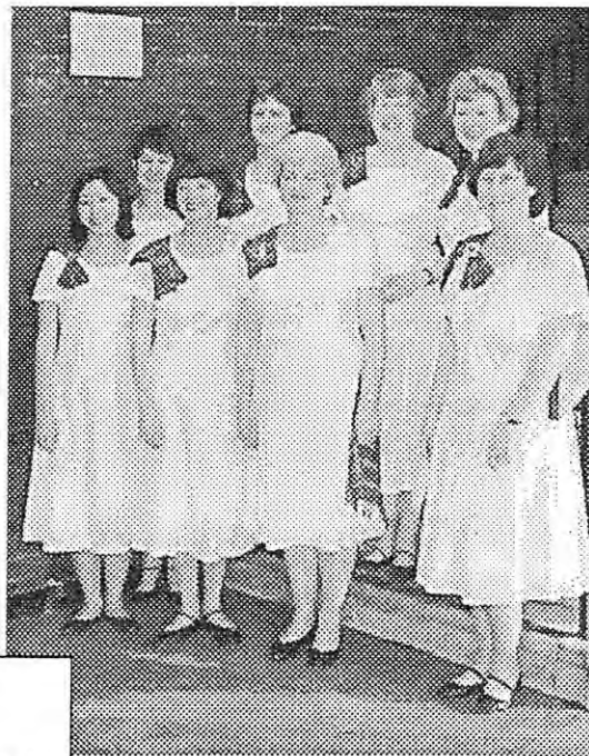
The Ladies team in new branch white dresses