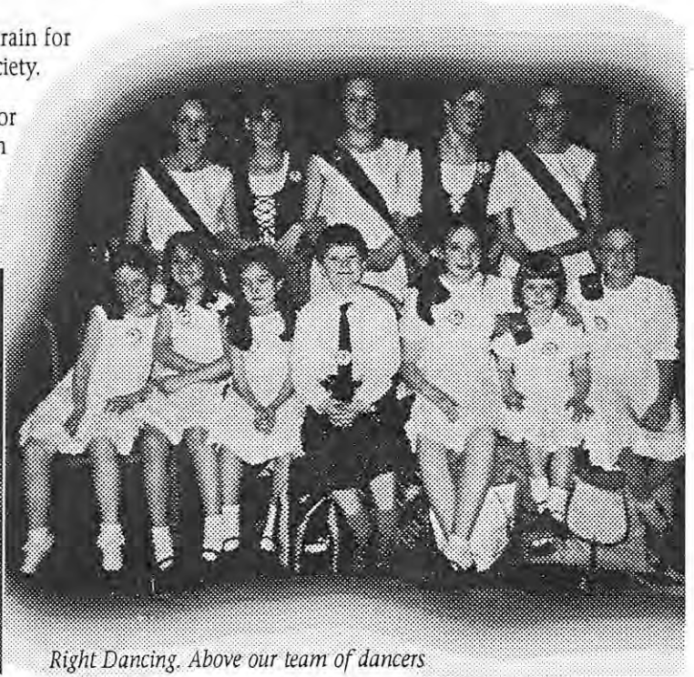
Right Dancing. Above our team of dancers

The programme consisted of round the room dances for everyone, interspersed by dances of three ability levels, elementary, intermediate and advanced. Our youngest dancers joined in the elementary dances and our experienced dancers joined in the advanced dances. Sometimes our experienced dancers helped out the younger ones by making up the set. Sometimes a few of our younger dancers were thrilled by the challenge of helping out our advanced dancers to make up their set, and by dancing Highland Schottische for the first time.