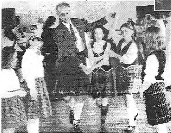
RSCDS Chairman dancing with children

Teams came for near and far - own Branch, Gateshead, Newcastle, Darlington, Wakefield, Rotherham, Doncaster and all points in between.