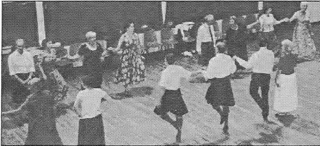
Dancers enjoying the branch dance. Why not join the fun - there are plenty of opportunities.

A small but select group, 32 in all, gathered in St Mary's Church hall on Saturday afternoon of the 15th September 2001 for the Leeds Branch annual 1/2 day school.