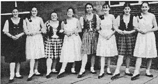
The Teenage team danced MacDonald of Sleat

As it was the 21st Anniversary of the Leeds Branch Children's