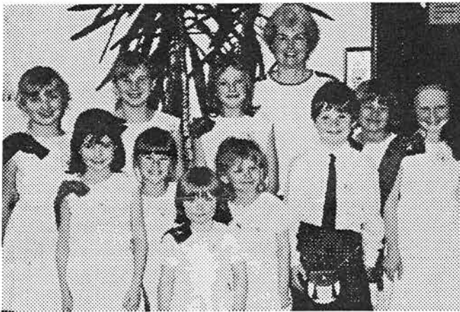
The Junior team danced Scotland