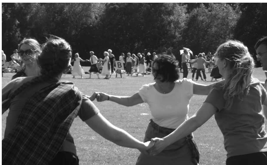
Dancing at the White Rose Festival 2017