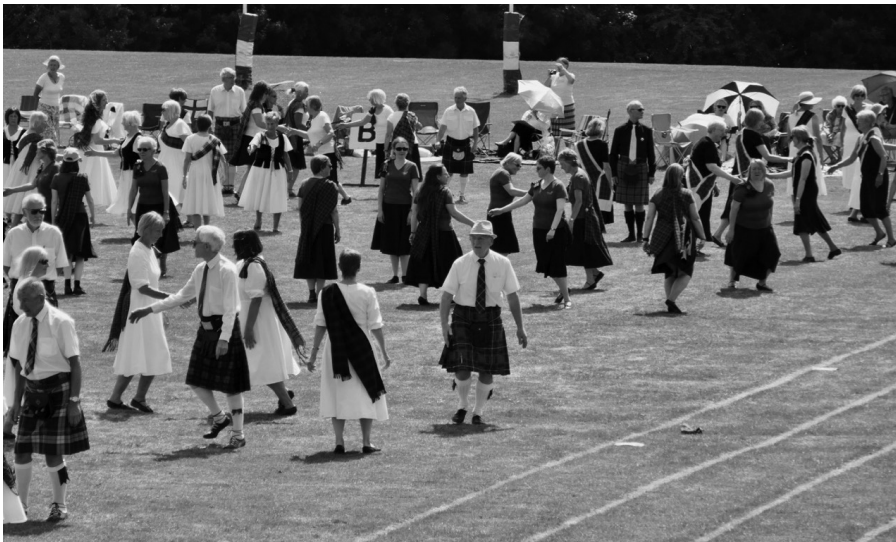
White Rose Festival 2018