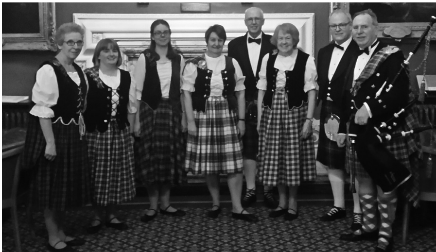
Branch Members, ready to do a demonstration for Burns night at Castle Grove.