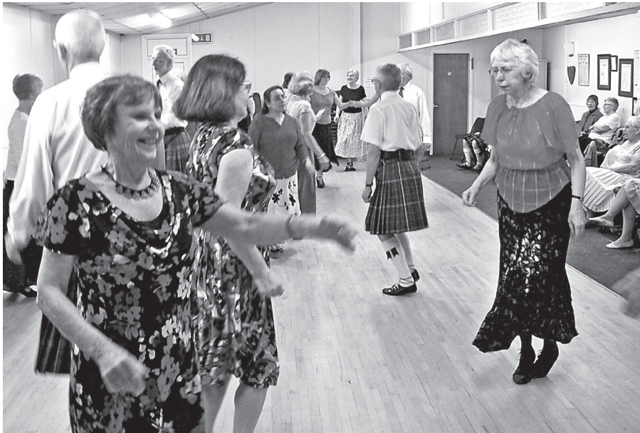
Askwith Thistle Club Turns 60 see page 3.