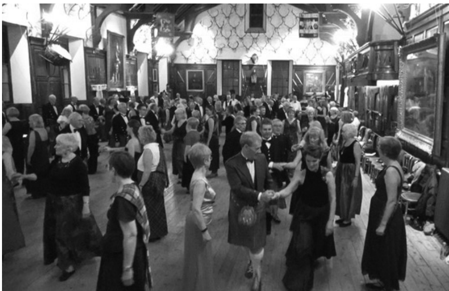
Dancing in the ballroom at Blair Castle, RSCDS Winter School