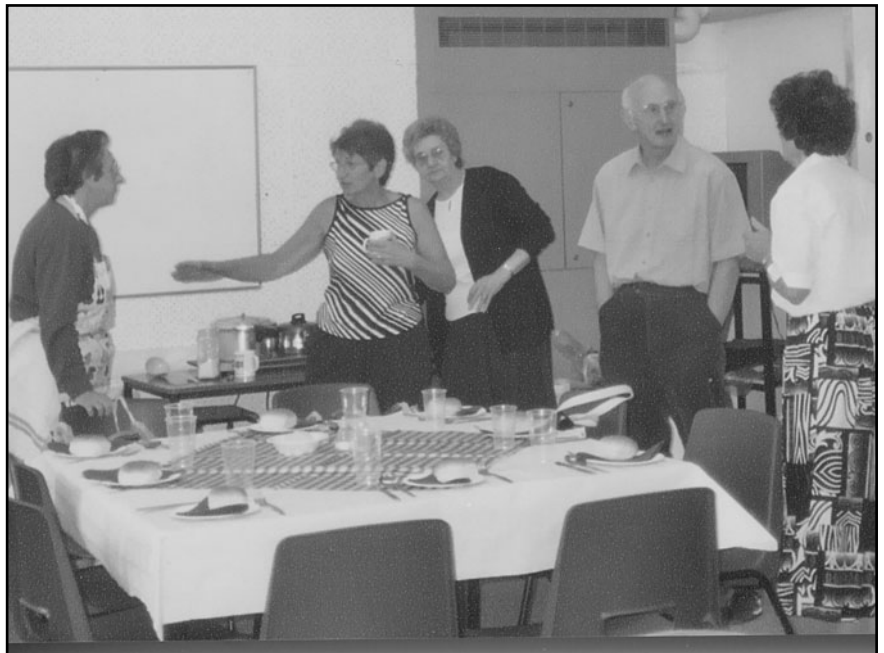
Some of the dancers helping with the catering.

The Day School this year presented us with more of a challenge for our catering corps. Not only did we have to prepare a high tea but also a snack type lunch. Ideas were tossed around and we decided to do our usual high tea and soup and baked potatoes at lunch-time. We had an early trial run at the Musicians Workshop and all went well. The week preceding the Day School resulted in many baked potatoes being consumed after they were timed and baked in various parts of the oven. Confidence increased as the busy day arrived. The oven was filled with potatoes before going to West Park. The preparations went reasonably smoothly there apart from not having the plug for the oven (the lady who looks after the plug was out shopping!). At the appointed hour a car dashed back to fetch the potatoes and then our problems started. Some potatoes were ready but many were not. A mad half-hour ensued moving the potatoes round and giving them a blitz in the microwave. A second car arrived to take back the cooked potatoes to relieve the hunger of teacher and dancers. Finally the original car returned to West Park with the remainder of the potatoes and we crept in rather sheepishly.