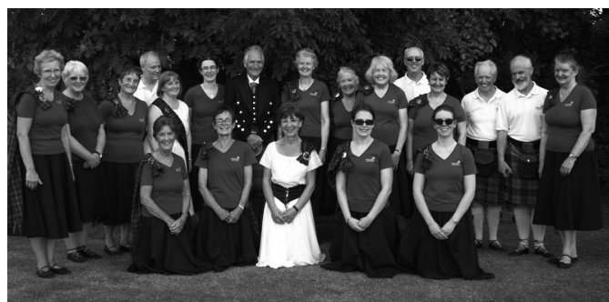
One of the Leeds Teams with our VIPs from America

We look forward to seeing everyone again next year on 12 July 2014.