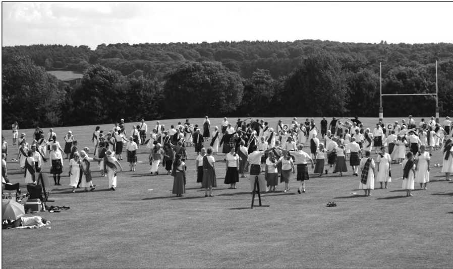
Dancing at the White Rose Festival July 2013