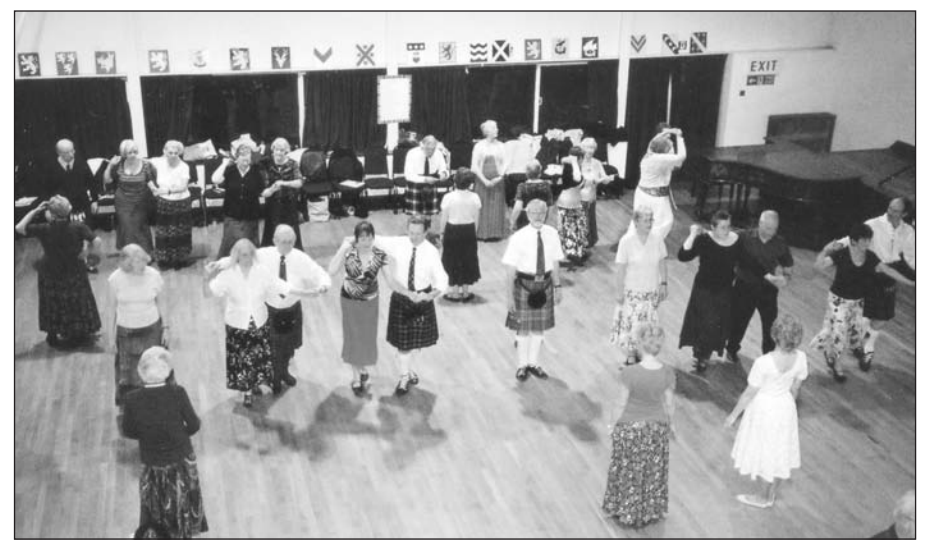
Our February Dance