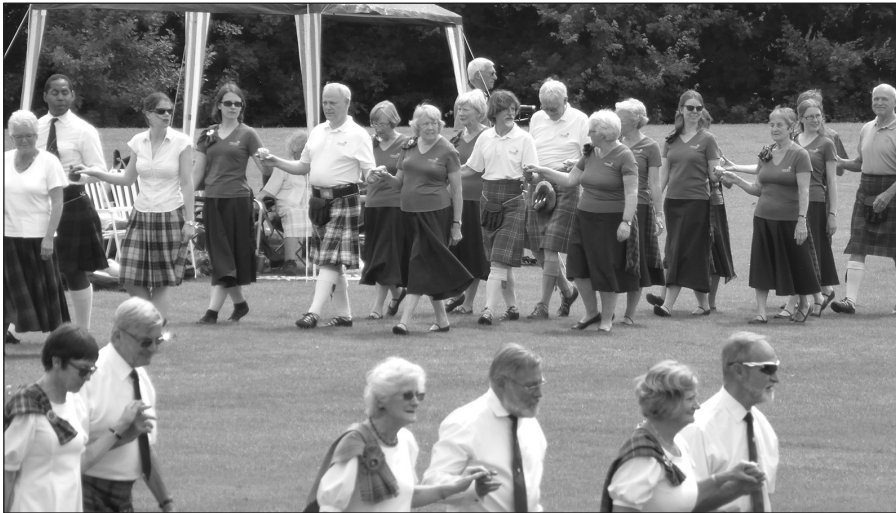
White Rose Festival 2014